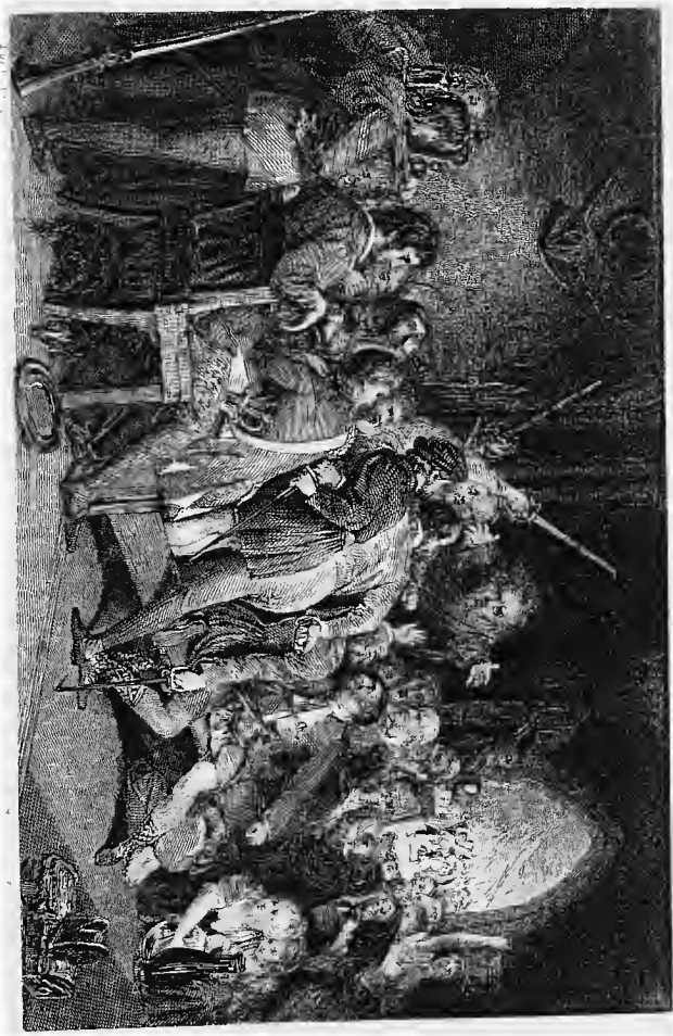
THE HALL OF GINNACODUCH, AT THE GREAT FEAST.